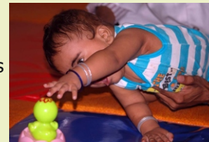
functional skill training

Manual Stretching Strengthening Exercises Balance Training Gait Training Electrotherapy Hydrotherapy