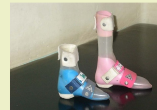
lower limb calipers

Hand Splints Ankle Foot Orthosis Knees-Ankle-Foot-Orthosis Gaiters / Braces Walker / Crutch / Canes Special Chair